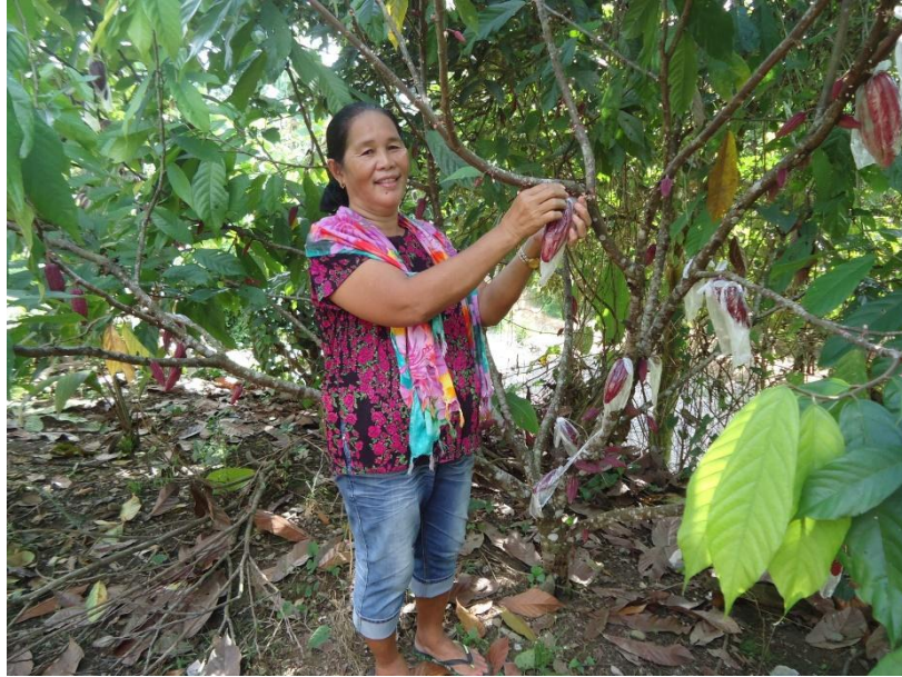
A woman farmer doing care and maintenance activities in her cacao farm