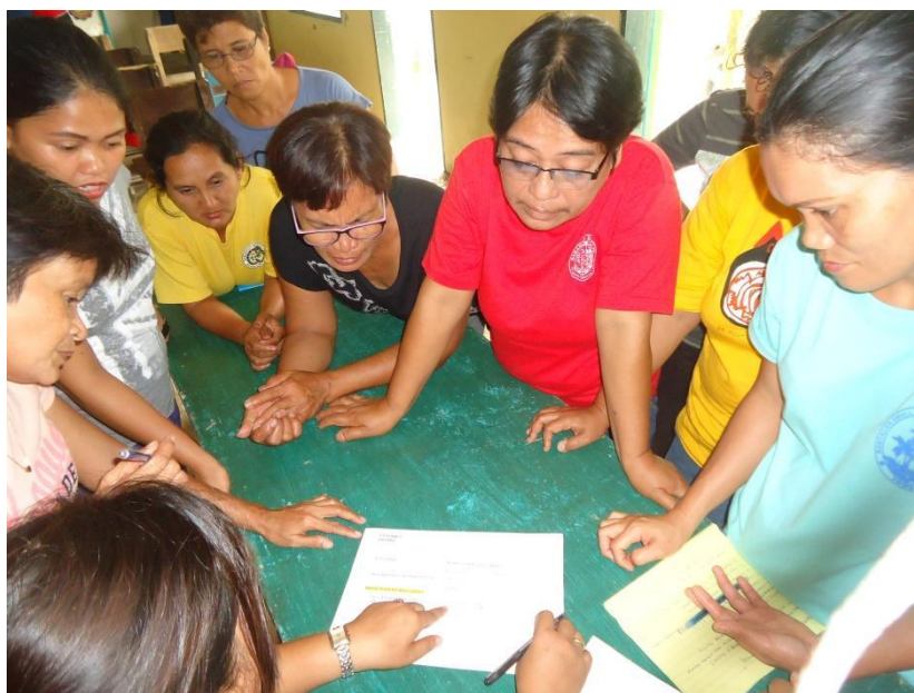
Women at BASCOFACO prepared a DRRM Plan for their community