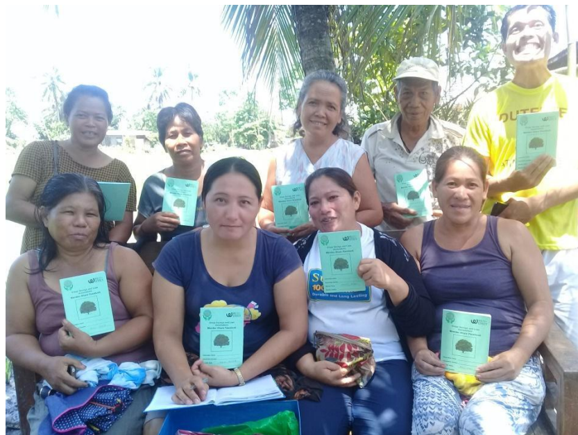
Women organized their GSLA to enhance access to needed financial services